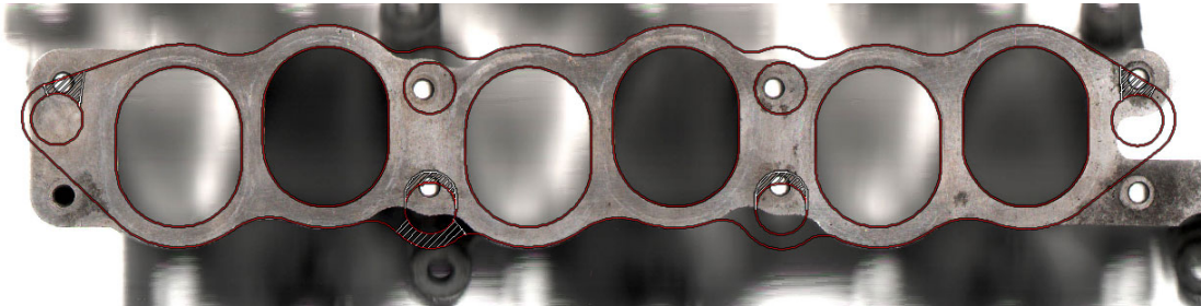
Pic 1 Illustration of the 95-99 Maxima Upper Intake Manifold Spacer on the 00-01 Maxima Lower Intake Manifold

1) Before any cuts are made, place the Upper Intake Manifold Spacer on the lower intake manifold and get a good idea what is required to allow all the bolt holes to line up. Take a close look at Pic 1. All white hatched areas in illustration will be removed so that the bolt holes are aligned properly.